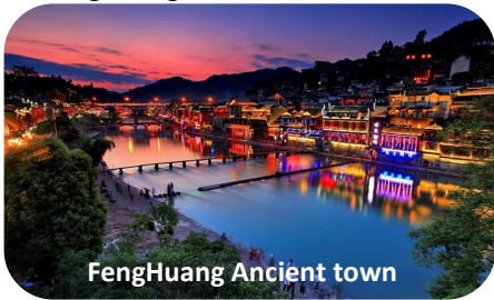
FengHuang Ancient town

Day 3 ~ FengHuang 🚗 (3h) ZhangJiaJie (B/L/D)