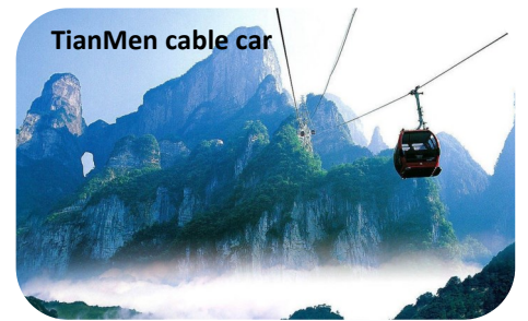
TianMen cable car

*English itinerary is translated from Chinese version. If there is A difference, the Chinese itinerary will be taken as the correct version.